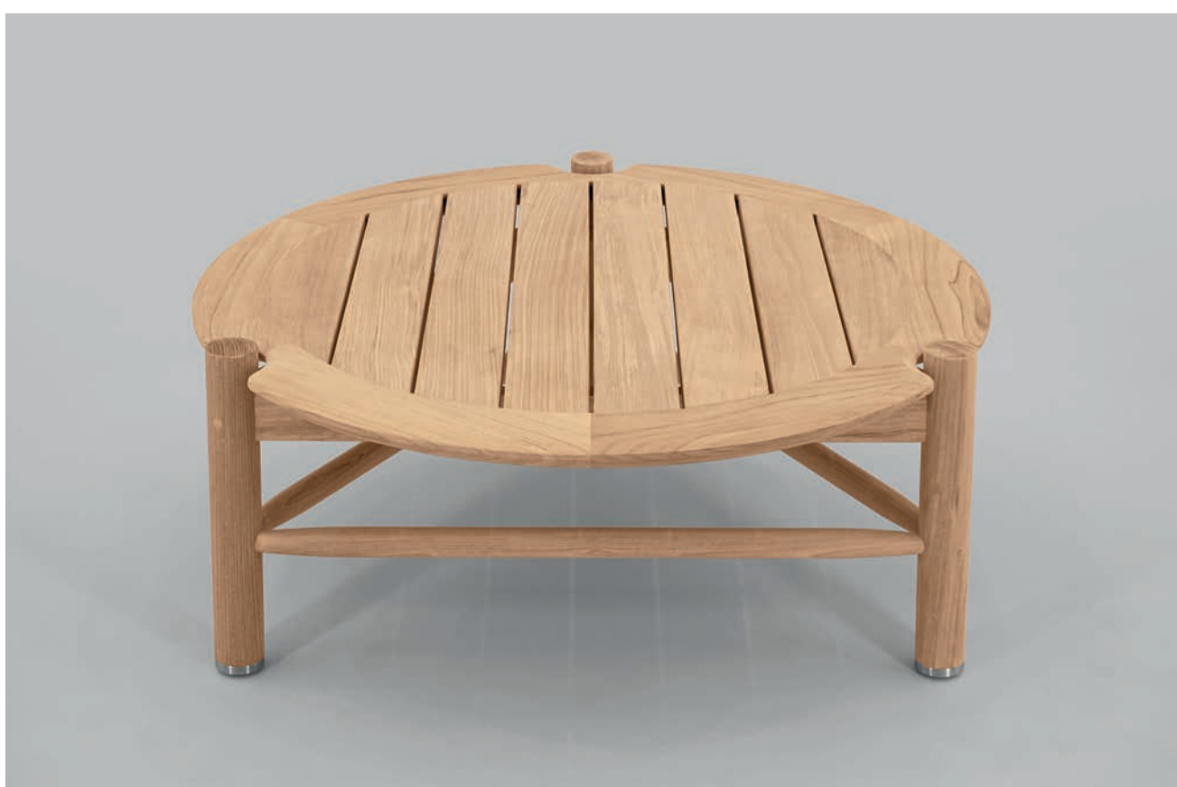
SALINA ROUND COFFEE TABLE

Solid, plantation teak frame with brushed stainless steel details.