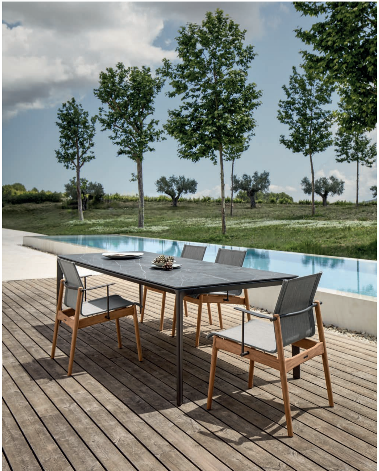
CARVER + SWAY TEAK