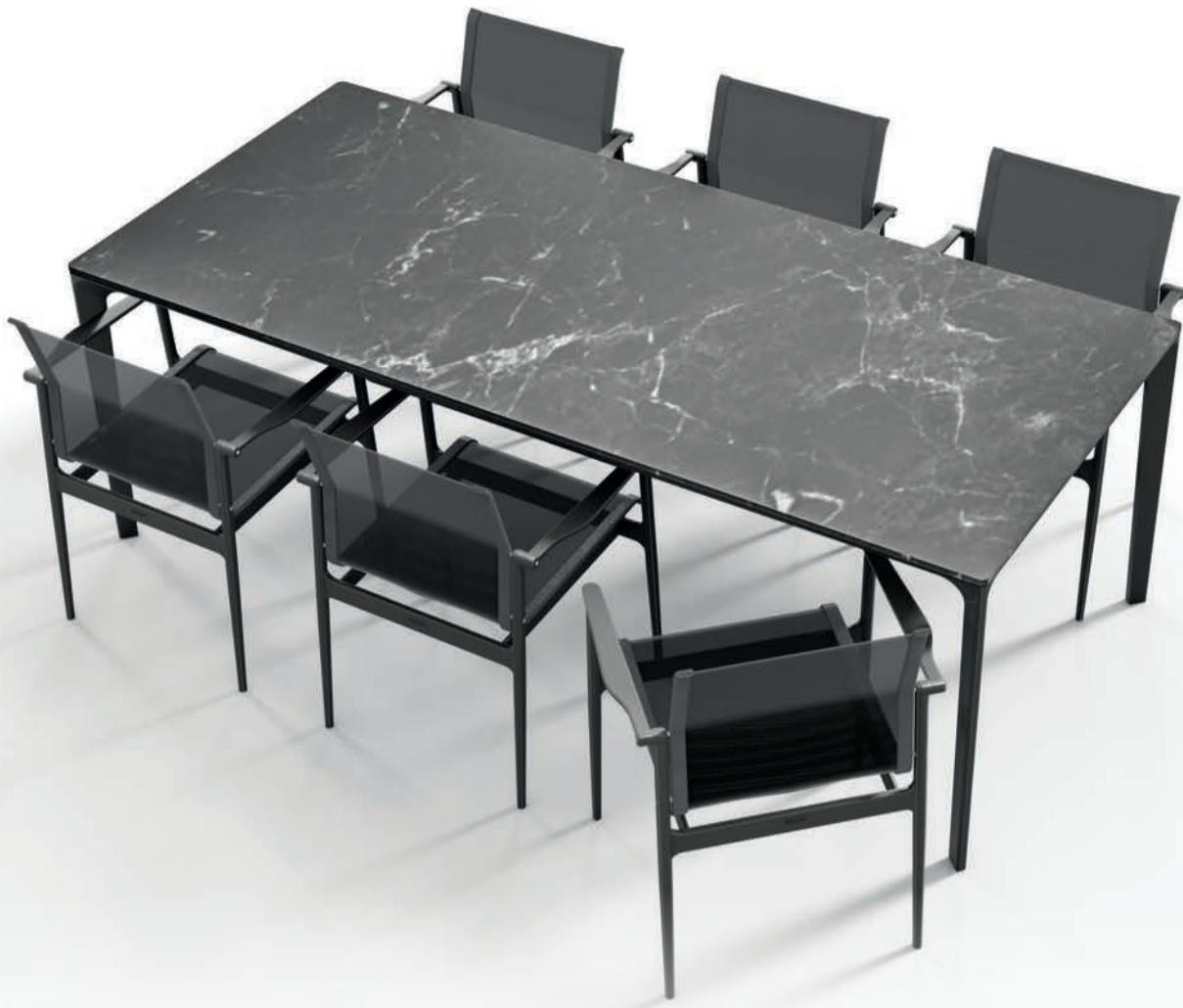
CARVER + 180

180's no-nonsense lines are a functional favourite. With design cues emulating traditional wooden furniture and a resilient combination of powder coated aluminium frames and weatherproof sling seats.